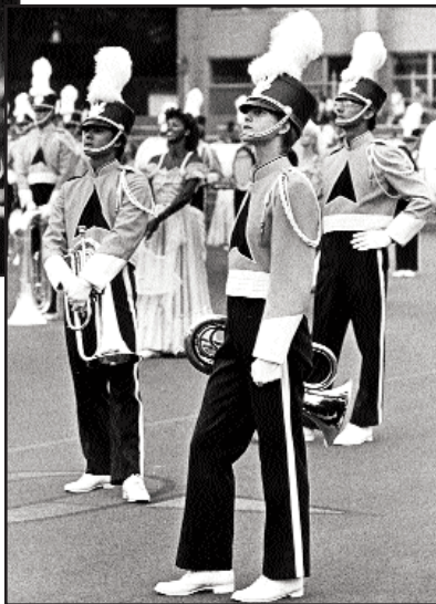
More white on the uniform, including white shoes, gave a bright look to the 1990 Spirit of Atlanta at Montclair, NJ.

involved came true and Spirit found its way back into the Saturday night show at the DCI Championships in Madison, WI, on the occasion of DCI's 30th anniversary.