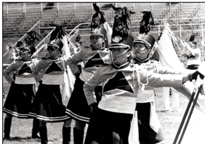
Spirit of Atlanta at DCI Midwest prelims in Whitewater, WI, 1978.