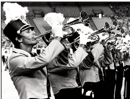
A radical uniform change saw the delta dropped in 1981, here at the DCI Championships in Montreal.