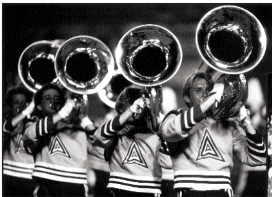
The 1984 Spirit of Atlanta at the hometown DCI Championships in Atlanta.

Jacksonville State University for badly-needed rehearsal sites, the organization brushed with disaster when management sought, in an early-June surprise, to fold the corps.