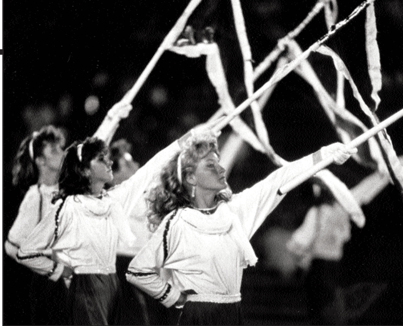
Spirit at the 1985 DCI Championships in Madison, WI.

Spirit has traveled the long road from upstart, to competitive greatness, then struggle, survival and rebirth. All those involved are proud and humbled to take their organization again on the path of success and service to youth.